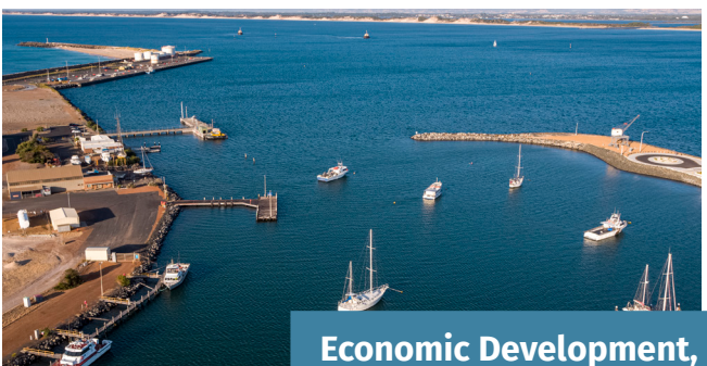
Diversification, and Innovation